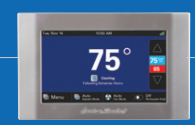
AccuLink™ Platinum 850 Contro