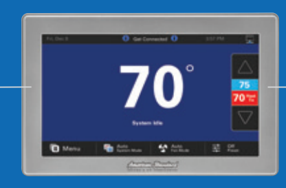
AccuLink™ Platinum 1050 Control